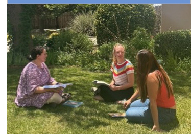
In Person & Online Sessions