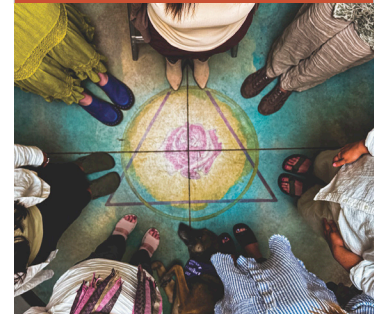
Tierra Nueva Counseling Center Open House